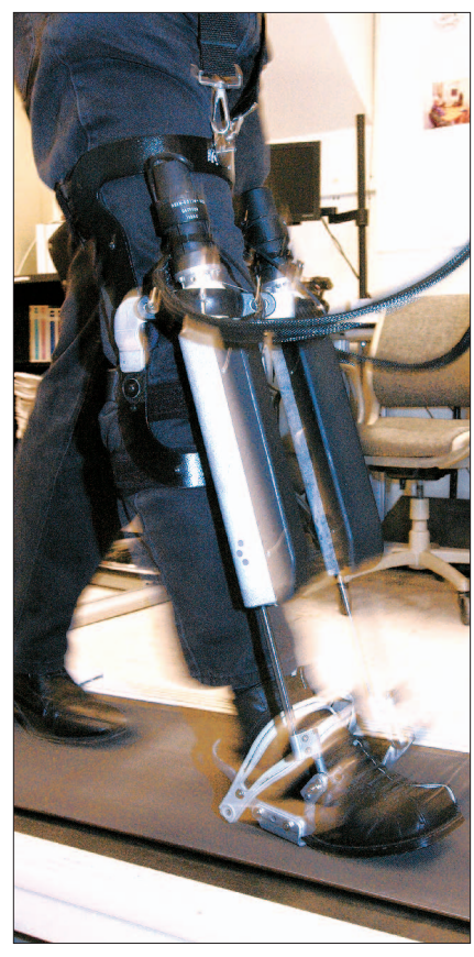
The Anklebot helps improve movement in paralyzed ankles.

"As far as we know, we were the first to use robots to deliver therapy in continuous