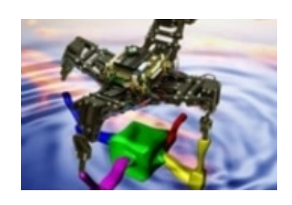
Automaton, Know Thyself: Robots Become Self-Aware