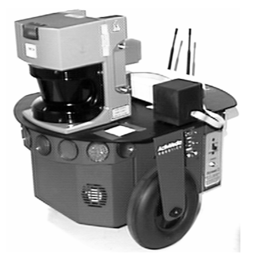
Figure 1: Player can control many popular robot devices, including the Pioneer 2-DX mobile robot and peripherals pictured here.

ming language that provides socket support, and almost every language does. Client libraries, which encapsulate the details of the Player message protocol and facilitate the development of control programs, are currently available in: C, C++, Tcl, Python, Java, and Common LISP. With language neutrality comes platform neutrality; control programs written in Tcl, Python, and Java can run on almost any modern system, even those running Windows. In addition, the C++ client library has been ported to the Win32 environment.